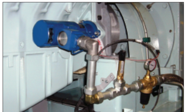
T25 installed on a MAN D2842I.

The TurboTwin brand has the distinction of having the most turbine air starters in the field, and the most turbine air starters operating in the world's harshest and most demanding environments. There is a reason TurboTwin is the number one choice of system integrators, packagers, and aftermarket end users – "unparalleled starting reliability."